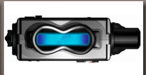
XPAK provides easy viewing of test results within seconds.